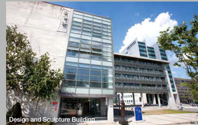
Design and Sculpture Building