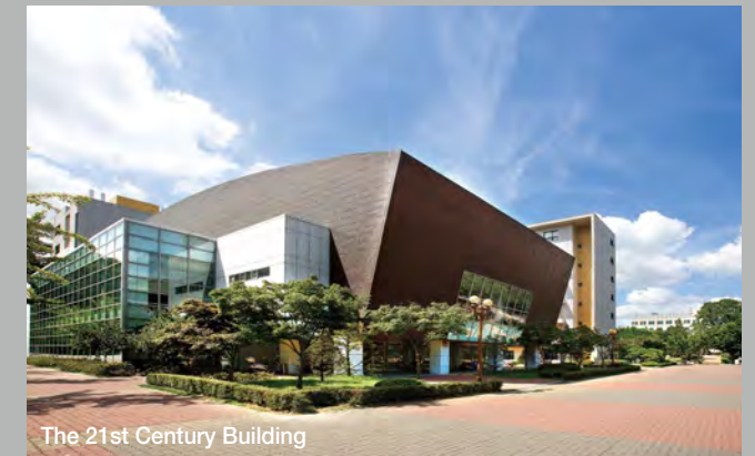
The 21st Century Building