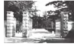
The Front Gate Remodeled in 1967