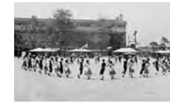
Dance Party at the Agricultural Festival at the 58th Anniversary in 1976

It is a rarity to change a front gate of a university as many times as the UOS. The forerunner was Kyung Sung Public Agricultural College on May 1, 1918, followed by Seoul Agricultural Basic College in June 1950 and four-year Seoul Agricultural College in March 1956. In October 1981, it was renamed as the College of Seoul, and as it was elevated to a comprehensive university in March 1987 to be renamed as the current 'University of Seoul.' The photo shows the front gate of Seoul Agricultural College in 1967, which was made of granite. It was used until the school was changed into Seoul Industrial College