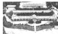
A View of Kyung Sung Public Agricultural College in 1937 (current Gyeongnonggwang and the Gallery)