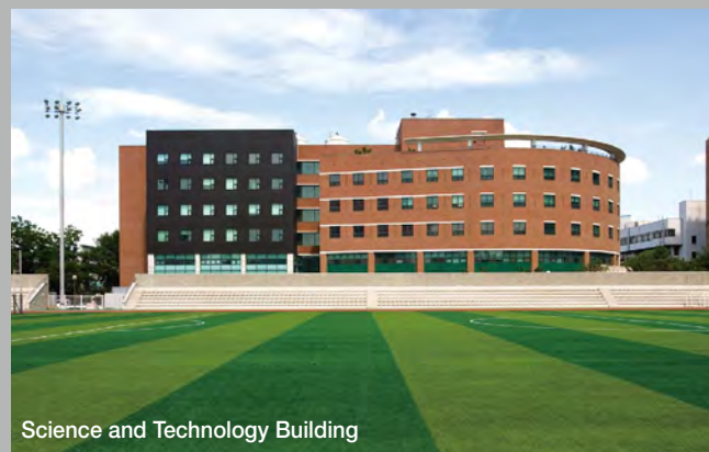
Science and Technology Building