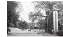
The UOS Museum Opened in 1984

The Agricultural Festival was held on the UOS' May 1 anniversary with such diverse events as a sports competition, an academic symposium and an exhibition. A folk dance session with female students dressed in Swiss style of primary colors dancing with male students from Reserve Officers' Training Corps (ROTC) was the biggest attention grabber. The beautiful dancers with a dream on campus were the jewels of the festival.