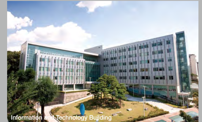
Information and Technology Building