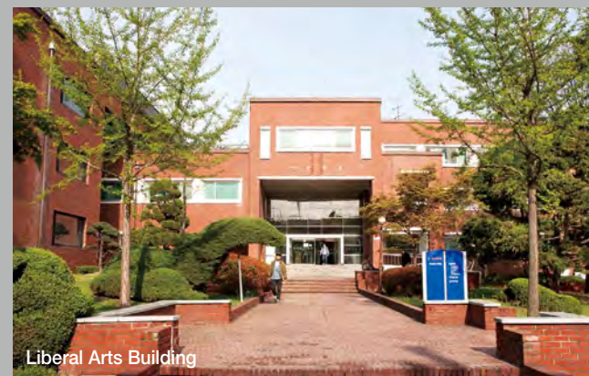
Liberal Arts Building